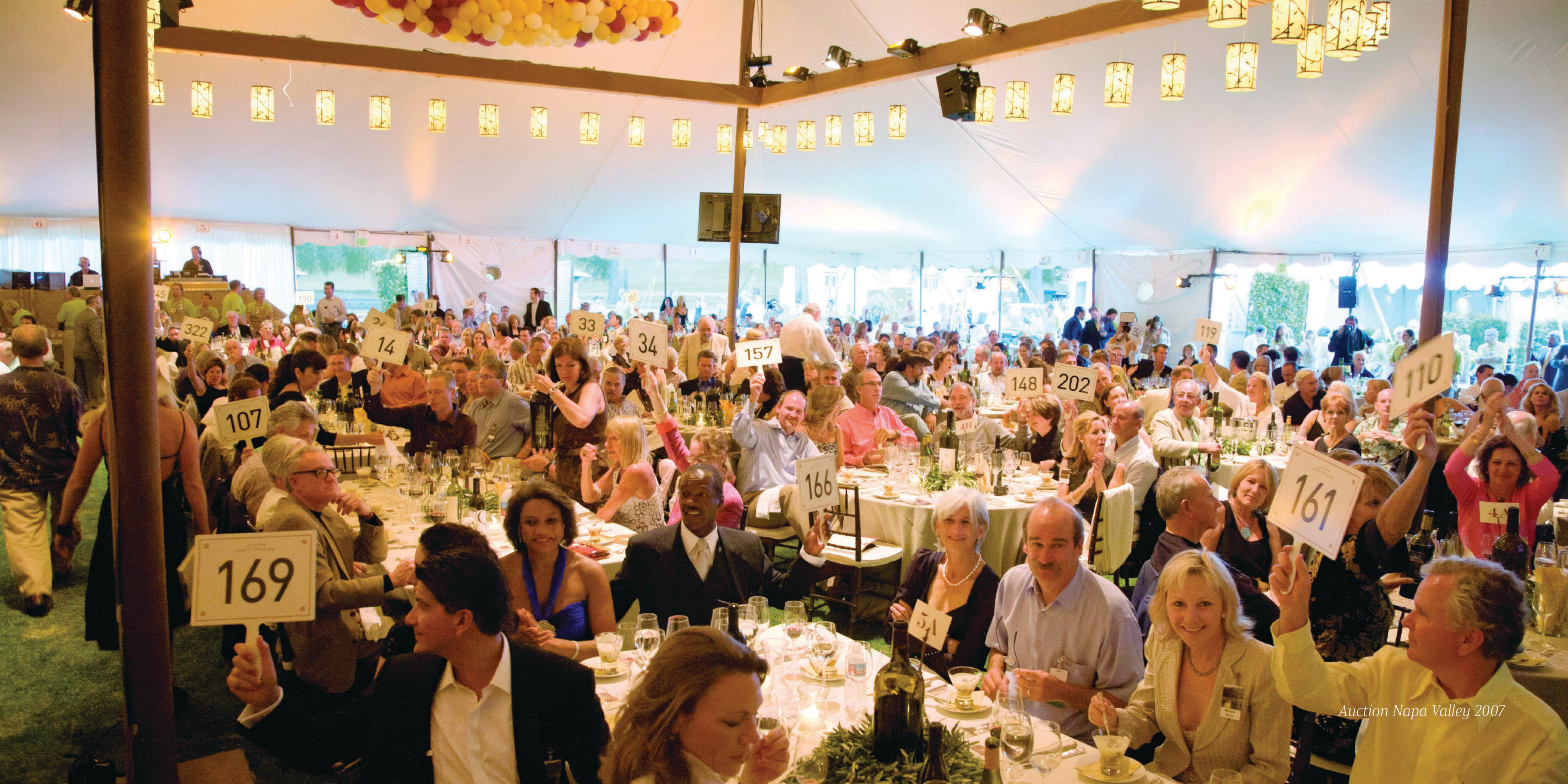
Auction Napa Valley 2007